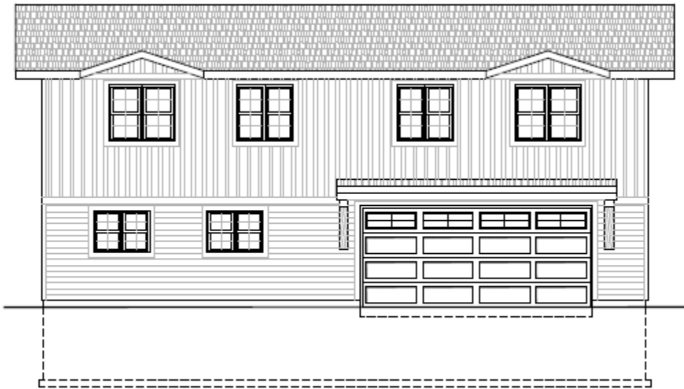
NORTH ELEVATION WITH GARAGE ADDITION