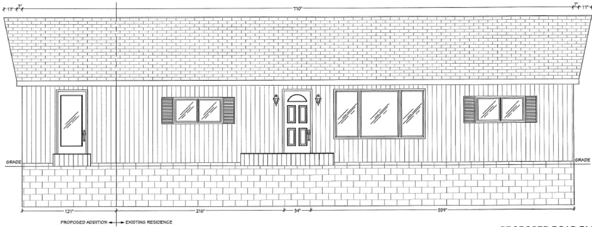
PROPOSED ROAD FACING ELEVATION SCALE: 3/16" = 1'-0"