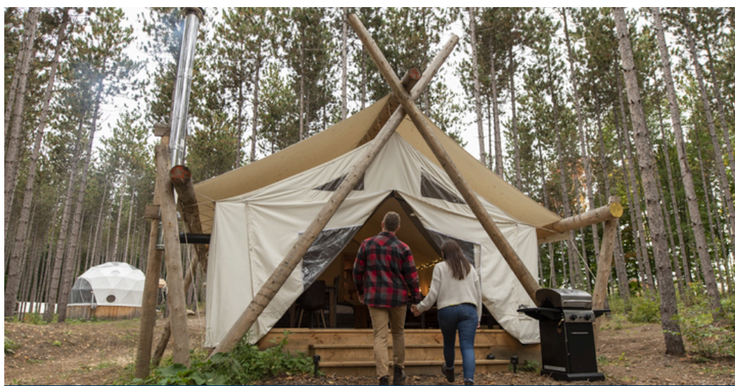
Featured in the Globe & Mail Travel Guide as a "Canadian Hidden Gem"