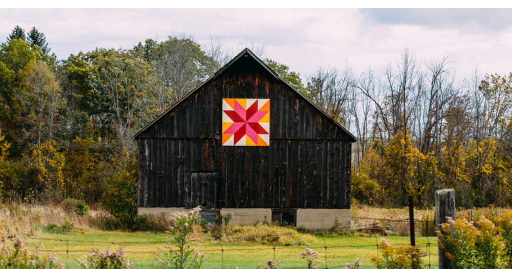
25+ Oro-Medonte Barn Quilts on Display in the rolling hills of Oro-Medonte