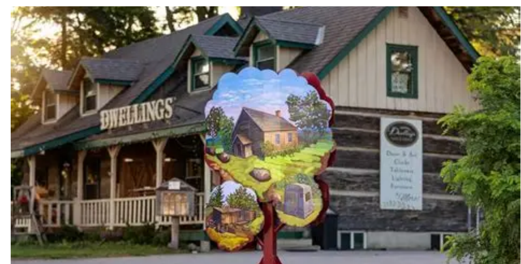
Home to 30+ Oro-Medonte Art_Trees