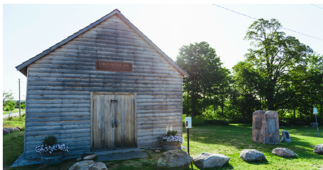
National Historic Site ~ Oro African Episcopal Church