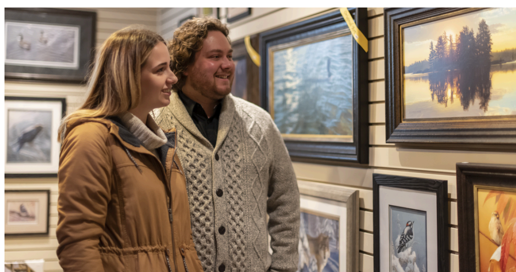
Home of the Images Art Tour for 40+ Years