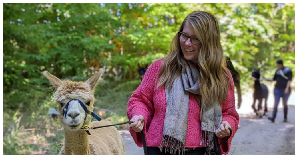
A Variety of On-Farm Activities & Farm Gate Locations