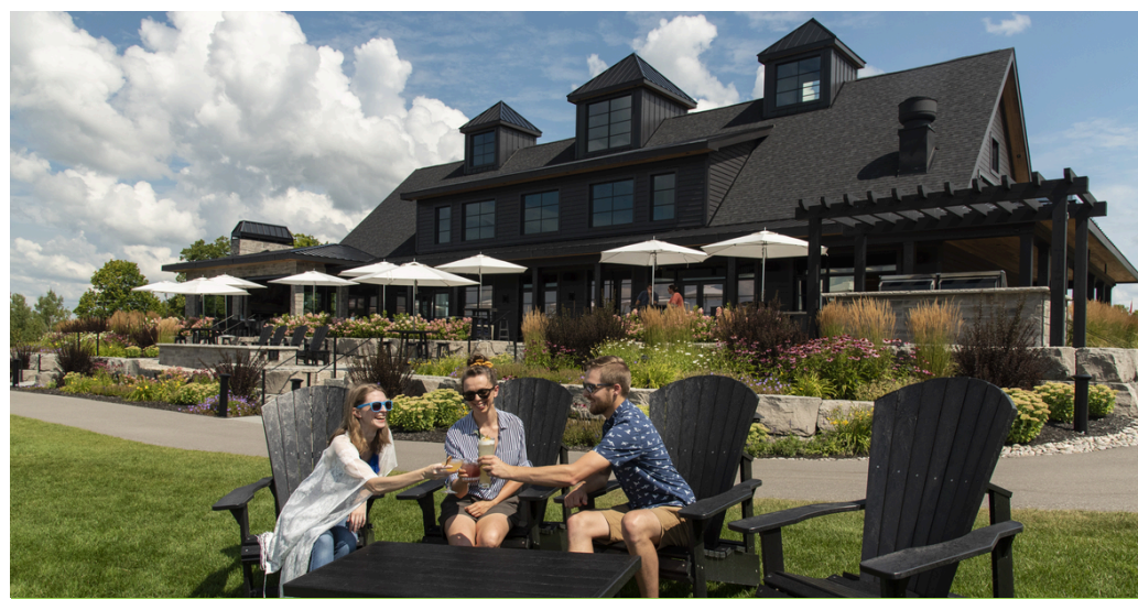
Home to Award Winning Restaurants