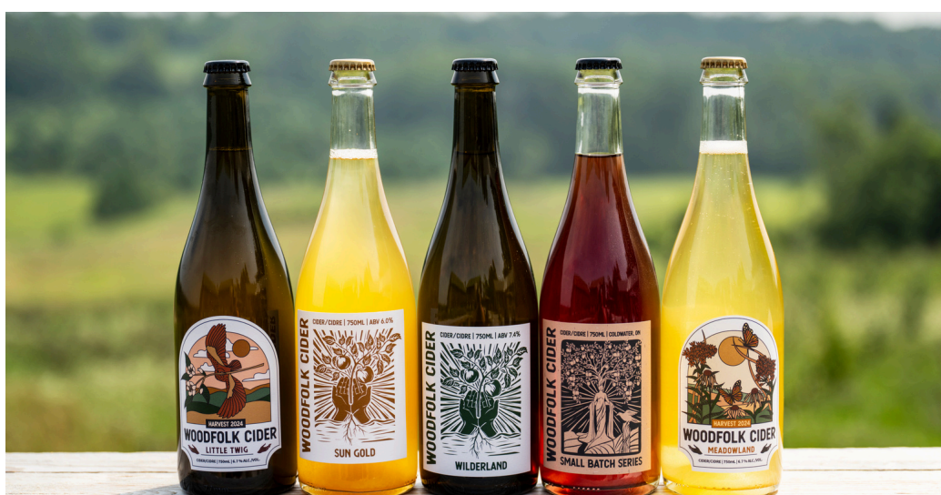
Feast On Certified Breweries & Cideries