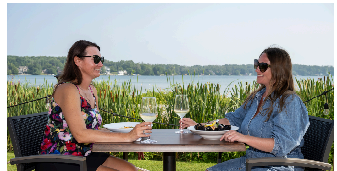
Memorable Dining with Scenic Views