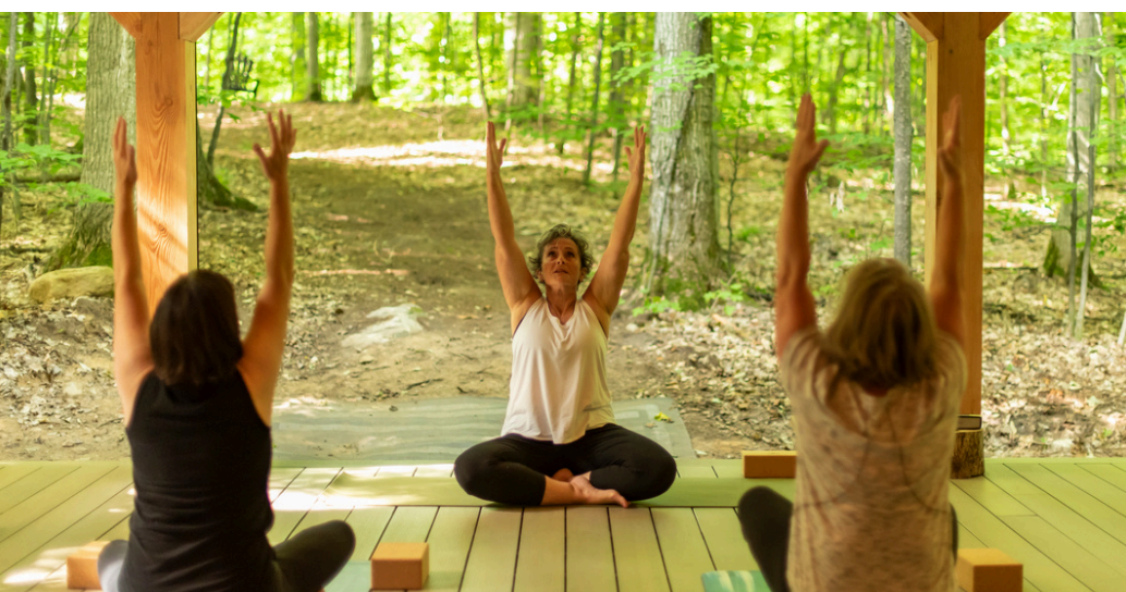
Restorative Experiences in Nature