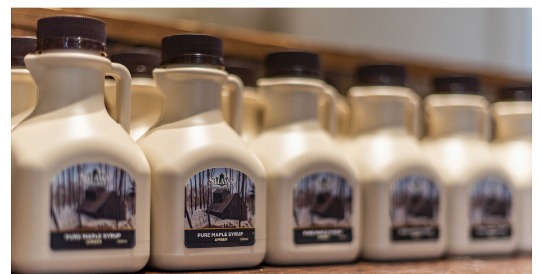
Home of 'Tap into Maple' ~ All Things Maple