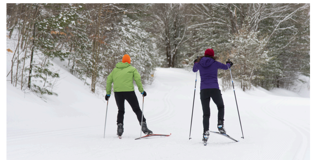
World Class Outdoor Recreation & Elite Athlete Training Grounds