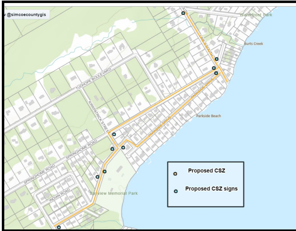
Figure 2 - Bayview Memorial Park, Boat Launch CZS

A sample of a new zone would include Lakeshore Rd East and Parkside Rd