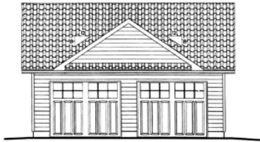
FRONT ELEVATION SCALE: 3/16" = 1'-0"