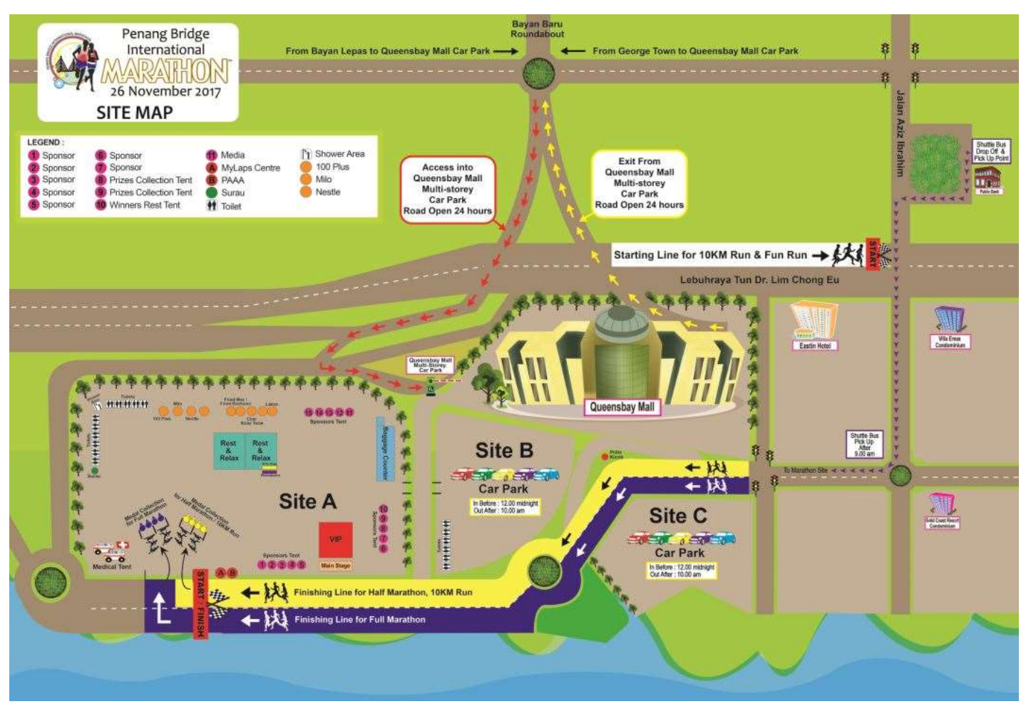
Figure 1 – Example of Site Map