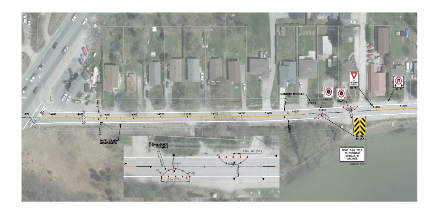
Appendix 1 – Current (August 2022) Traffic Calming Configuration